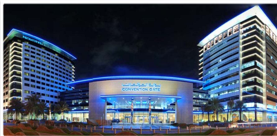
The Dubai World Trade Center, Venue of the upcoming IALM Congress

As can be seen from the definitive Congressional Scientific Programme, 4 Workshops and 13 Scientific Sessions have been organized, to be chaired and enriched by renowned Experts from across the Globe.